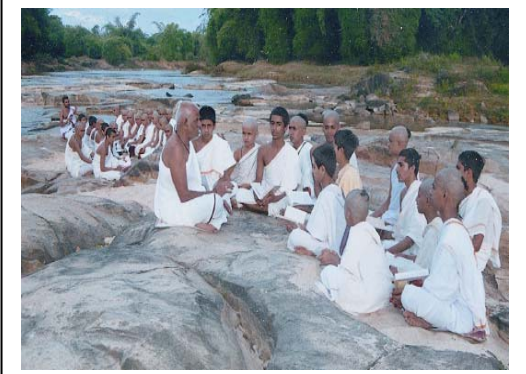
Vedic classes by the bank of the Sharavati river