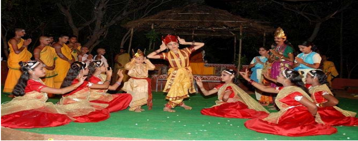
Pic: A scene from Ramayana enacted by students of the Gurukula