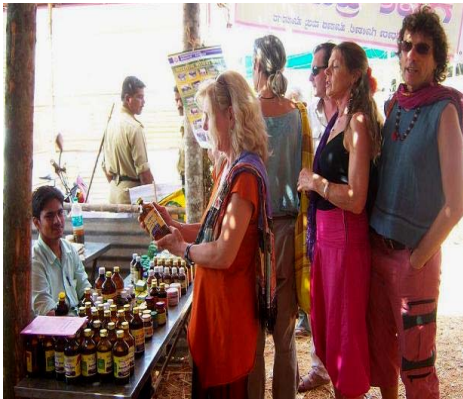
Pic: Visitors examining cow products at a stall in Gokarna

Shree Guruji's energies are now concentrated on the Vishwa Mangala Gou Grama Yathra (Sept 2009 – Jan 2010), which is an initiative to put Indian villages on the path of sustainable development by focusing on cow based agriculture. It is Guruji's conviction that a cow based rural economy is the cure to the destitution witnessed in Indian villages that are reeling under the ecological and economic fallouts of over-reliance on mechanization and chemical fertilizers.