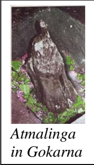
Atmalinga in Gokarna

When the Shreemath was established, Adi Shankara bestowed upon it the duty and privilege of worshipping the Atmalinga of Lord Mahabaleshwara. Shree Guruji has undertaken several initiatives to rejuvenate the temple and improve facilities for the devotees. Many developmental projects have been launched to give the town a much needed facelift.