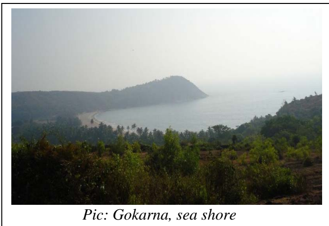
Pic: Gokarna, sea shore

Astrological divinations and local legends have revealed that the birth place of Hanuman is Kesari Theertha, a holy lake near Gokarna. Kesari, the father of Hanuman performed Thapas (meditation and prayers) at this sacred spot.