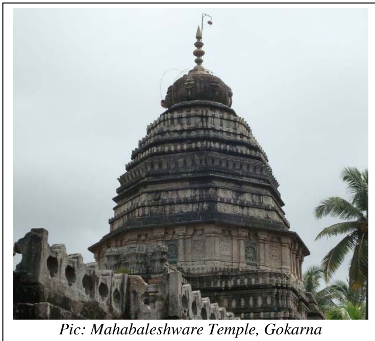
Pic: Mahabaleshwara Temple, Gokarna

Gokarna is one of the holiest pilgrim centers in India. It is a temple town, renowned as the birth place of Hanuman. It is the seat of the only Atmalingam in the world. Thousands of pilgrims flock to this town and offer prayers at its numerous temples.