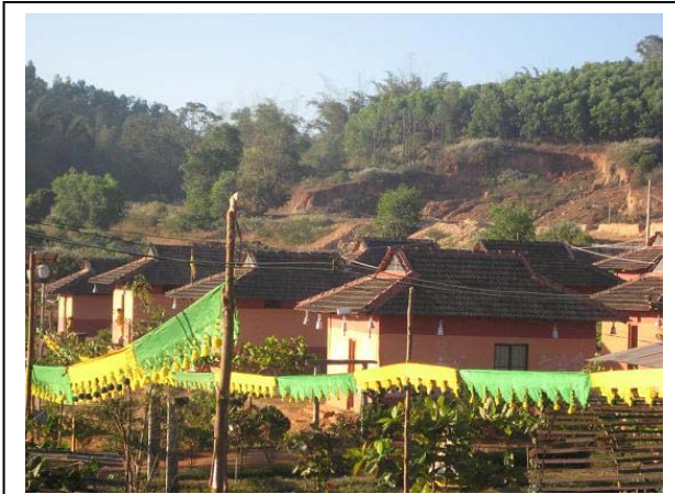
Pic: Living quarters at the Gurukul

Education is a very important aspect of human culture and civilization. We become the education we receive. According to the Ancient Indian tradition education transforms an individual into a complete person and Gurukula is the institution which moulds the people of a nation. The Sanskrit word Gurukula - means the Guru's residence. In this system of education, the teacher and the taught live together in the Guru's house and there is a close bonding between the two. The teacher is not a mere