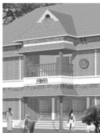
Proposed "Gurunivas" at "Ashoke", currently under construction.

This is indeed an exclusive opportunity for everyone to participate in this seva in whatever way possible. All shishyas are requested to support wholeheartedly, since this historical achievement will be handed over to all the future generations! Not supporting this redevelopment will mean an injustice to all the generations to come.