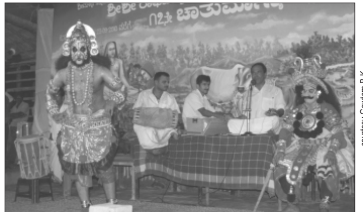
Yakshagana at Ashoke Gokarna during Chaturmas