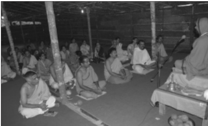
“Dhyana Shibir Saptaha” under the guidance of Parama Poojya Guruji

Note: Compare this to Mr.Stephen Hawking's recent observation (which has been in the newspapers) that God is not necessary for our Evolution. The greatness of the thoughts of our ancients who already knew the process of evolution, but credited even this knowledge to the Divine, is very humbling, isn't it?