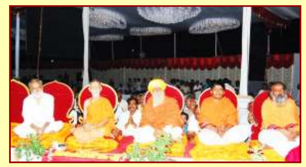
Sant Samagam at Gulburga Ramakatha