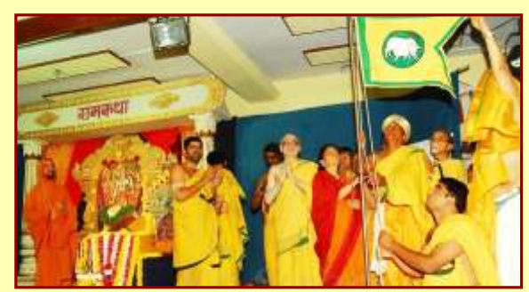
Dwajaarohana at the Dombivali Ramakatha