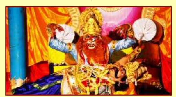
Ramakatha 'Rupaka' Drishya